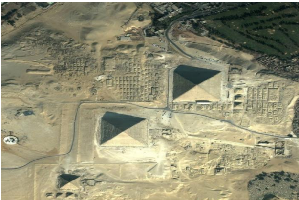
Pyramids of Giza, Egypt

3) Flying high - what are you flying over?