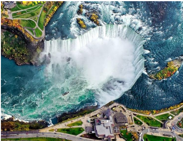
Niagara Falls, USA/Canada