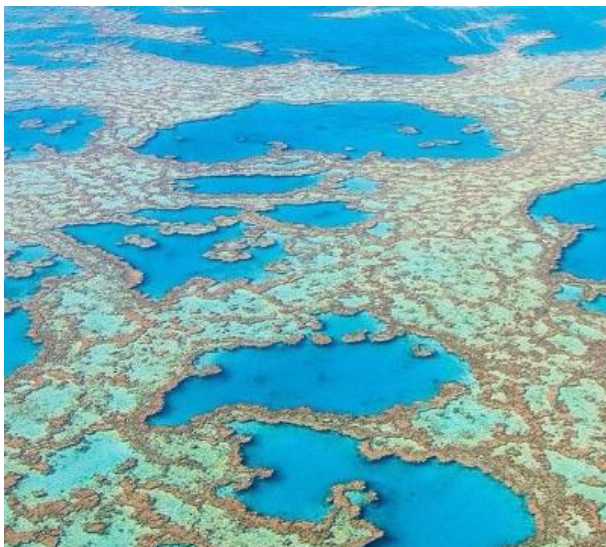
Great Barrier Reef, Australia