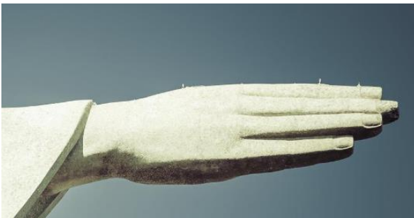
Christ the Redeemer – Rio de Janeiro, Brazil

7) Where are these towers and cables from?