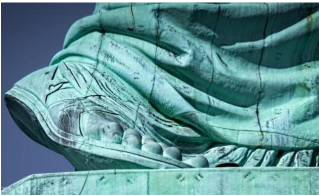
Statue of Liberty's – New York