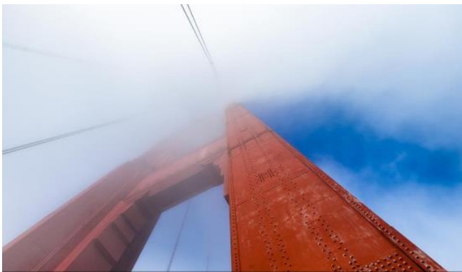
Golden Gate Bridge – San Francisco

7) Where are these towers and cables from?