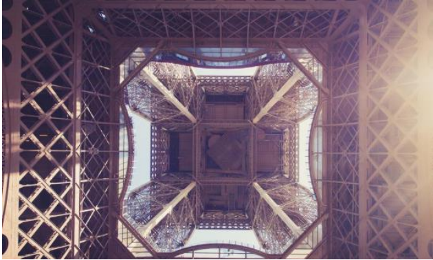
Eiffel Tower, Paris