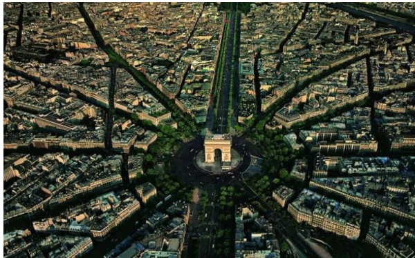
Arc de Triomphe - Paris

3) Flying high - what are you flying over?